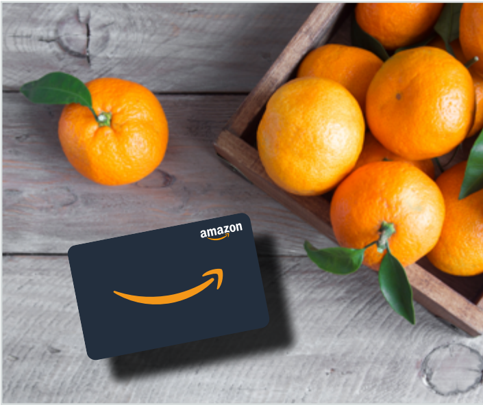
❌ The shadow is too opaque (set to 80% opacity). Additionally, it does not correlate with the light source, and the distance is off-set unrealistically.