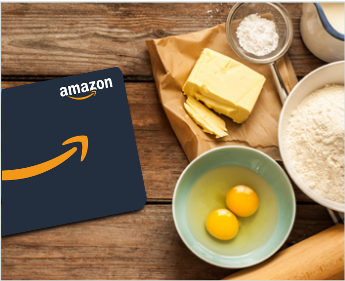
❌ The scale of the gift card is too large.