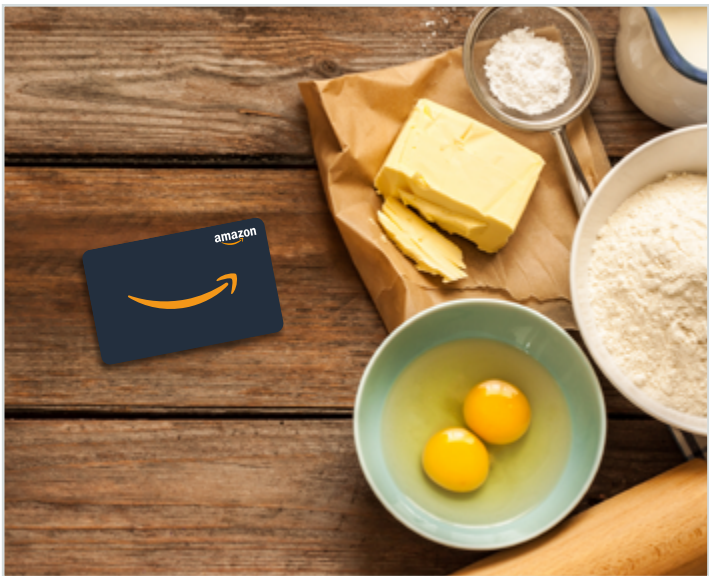
✅ The gift card is scaled realistically within the scene.

Use shadows to realistically set the gift card image within the scene. Specify 25%–50% opacity multiplied for the drop shadow. Ensure the scale, distance, and blur creates a subtle, slightly off-set drop shadow that matches the direction of other shadows in the scene.