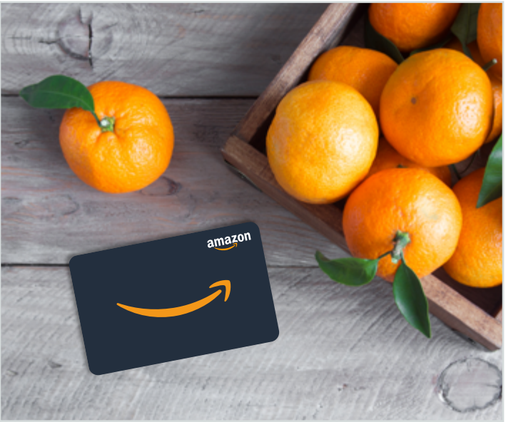
✅ The shadow is subtle, off-set realistically, and correlates to the direction of the light source within the scene.