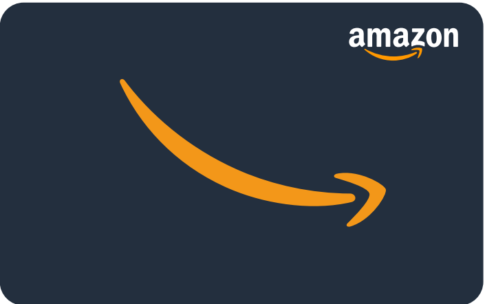
✗ Do not move, rotate, or re-arrange any elements.